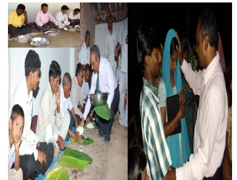
Pastors Lunch & Pray for students