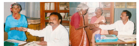
Monthly Financial support to Widows and aged

We have given this month's pension to 25 poor widows, Rs.100 each. We have also given 5kgs of rice to each of them. The widows were very happy as their burden and anxiety was reduced by our humane service.