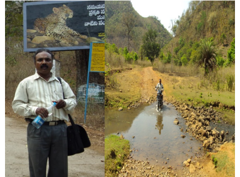
Director reached dangerous Tigers Zone / crossing lakes