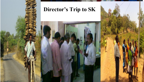
Director's Trip to SK