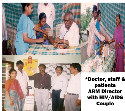
*Doctor, staff & patients ARM Director with HIV/AIDS Couple