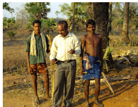
Director with Tribal Hunters... Watching arrow