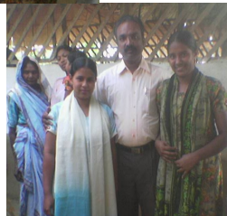
Joyful day in the congregation