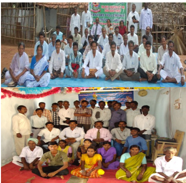
Pastors Fellowship in Two districts